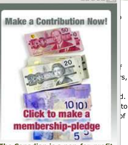
The Canadian is a non-for-profit National Newspaper with an international readership.

of psychopaths fighting to preserve their disproportionate power. And as that power grows ever-more-threatened, the psychopaths grow ever-more-desperate. We are witnessing the apotheosis of the overworld—the criminal syndicate or overlapping set of syndicates that lurks above ordinary society and law just as the underworld lurks below it. In 9/11 and the 9/11 wars, we are seeing the final desperate power-grab or "endgame" (Alex Jones) of brutal, cunning gangs of CIA drug-runners and President-killers; money-laundering international bankers and their hit-men, economic and otherwise; corrupt military contractors and gung-ho generals; corporate predators and their political enablers; brainwashers and mind-rapists euphemistically known as psy-ops experts